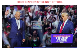
BOBBY KENNEDY IS TELLING THE TRUTH

NO VETERINARIANS NO HEALTHY FOOD 40% DEFICIENT IN VETS FOR - FEEDING, BREEDING, PROCESSING OUR FOOD