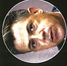
Congressman Jim Banks