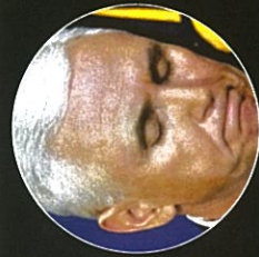
Vice President Mike Pence