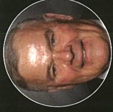
Congressman Jim Baird