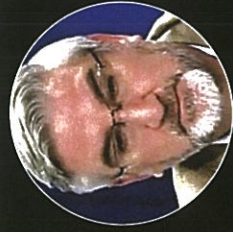
IN Governor Eric Holcomb