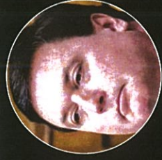
Attorney General Todd Rokita