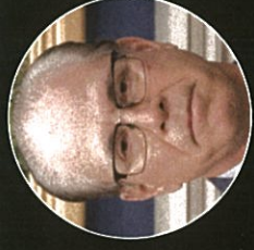
Senator Mike Braun